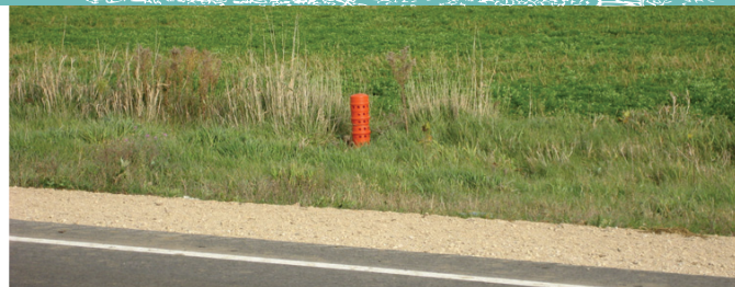
Figure 5: Tile vent installed at field edge.

(non-oxygenated) conditions, which can occur under flooding and high water tables. Since subsurface drain outlets are typically open to the atmosphere, soils around drains are aerobic (contain oxygen) at low levels. As groundwater enters the aerobic zone in and around the drain, solid iron precipitation occurs, creating optimal conditions for ochre growth. Ongoing maintenance is the only economical option for controlling iron ochre formation. If iron ochre has formed on plastic drain tiles, high and low pressure water jet cleaning is the most cost-effective management option. Higher pressure (> 400 psi) can be used with larger drain tile perforations or when drains are enveloped in gravel. Lower pressure (< 400 psi) should be used in sandy soils, when drain tile perforations are small, or when a synthetic sock is used to envelop the tile (Ford and Harmon, 1993).