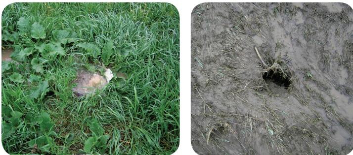
Figure 2: Sinkholes caused by tile blowout.

The most essential requirement for any drain system is an unobstructed and properly installed outlet. Drain tiles typically discharge into open ditch systems, which eventually flow into larger bodies of water, such as streams and rivers. The tile outlet to a ditch should be located approximately one foot above the normal ditch water level, allowing water to fall freely into the ditch to prevent erosion of the stream bank. Drainage ditches should be regularly inspected