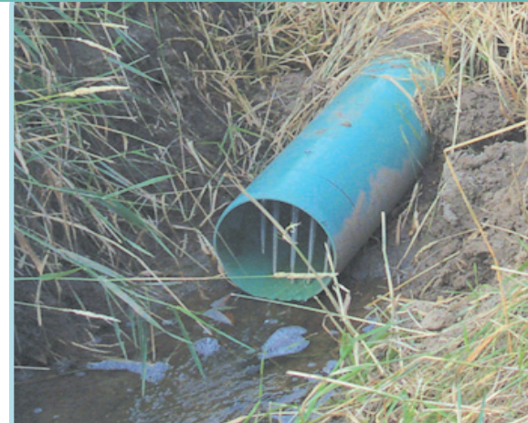
Figure 1: Tile outlet with a rodent guard.