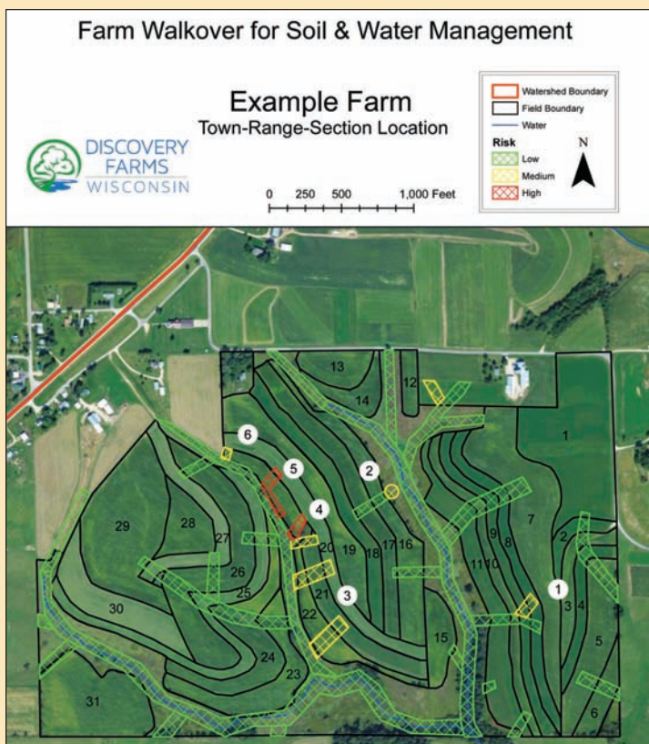
Example of mapped walkover observations.