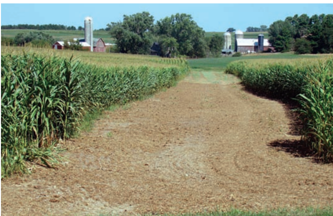
Newly reshaped waterway.