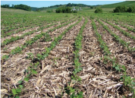
High-residue soybeans after corn.