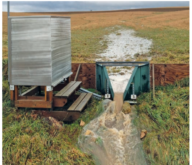
Spring runoff event when soils are vulnerable to erosion.

Only a small amount of annual precipitation actually runs off fields, and most of this soil transport and erosion occurs in April, May, and June. On monitored fields, up to half of all annual surface water runoff and almost all soil loss occurred during these months. Runoff dislodges soil from vulnerable areas and carries it off the landscape. So, the question is, do the areas on your farm that are vulnerable to soil erosion have enough protection from April to June? Minimizing soil loss means working with factors that are within your control and adapting to factors outside your control. You can't change the weather, but you can control your tillage and use of conservation practices.