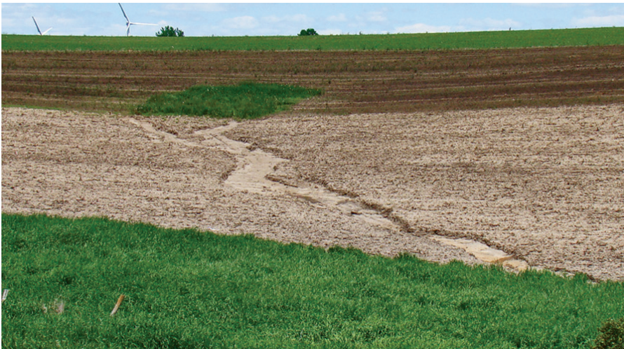
Concentrated flow area.

Observations from walkovers confirmed that most areas of the farms were very well managed and required no changes, but identified that relatively small areas were often responsible for the largest portion of soil losses.