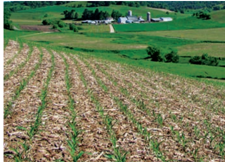
No-till corn planted on contour.