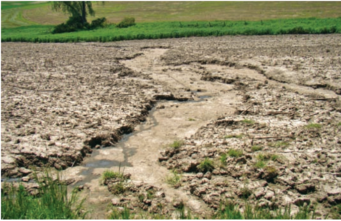
Erosion showing need for a waterway.