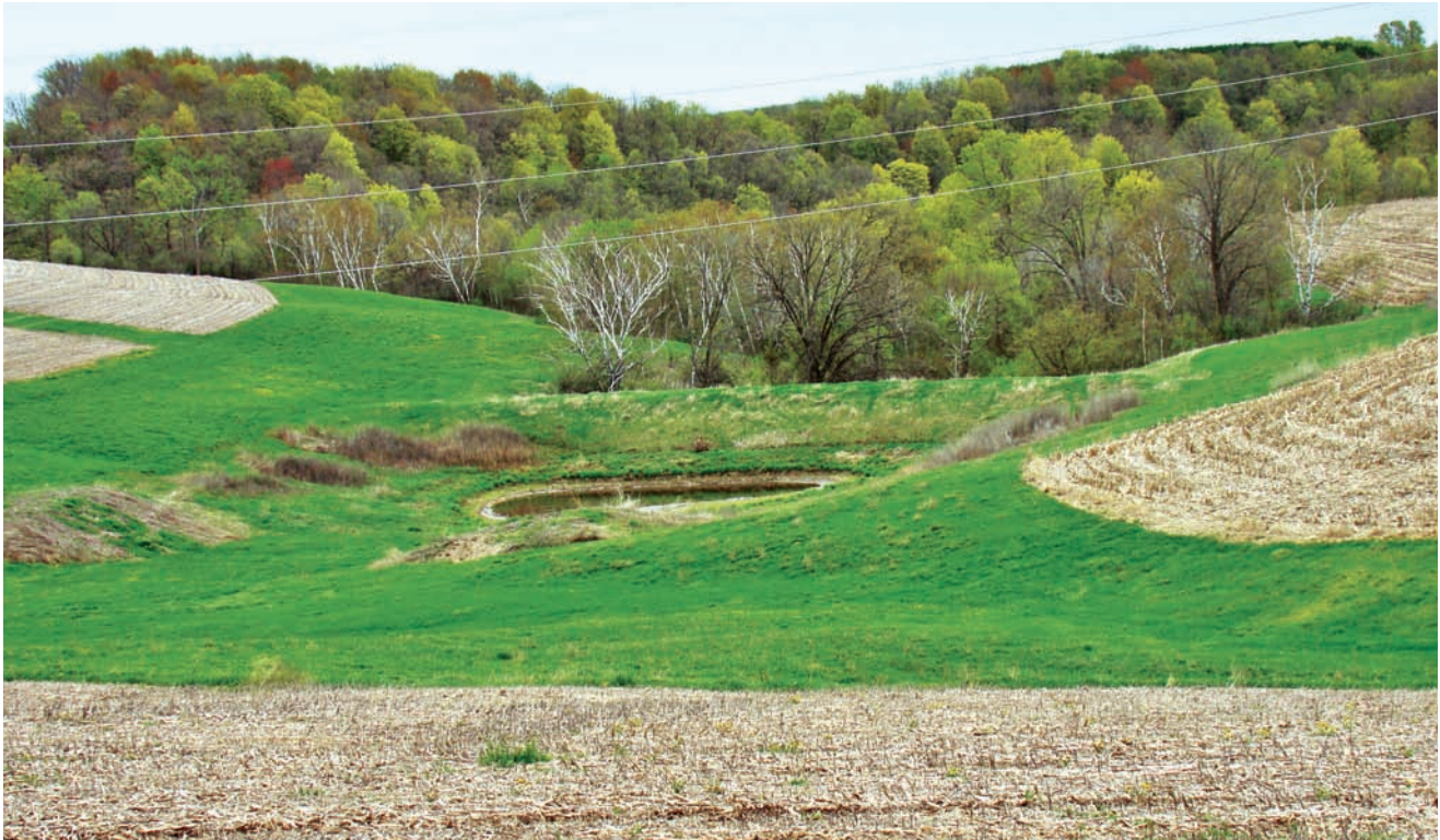
Grade stabilization structure at transition to wooded ravine.