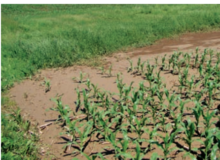
Sheet erosion accumulating at bottom of field.