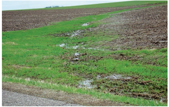
Grassed waterway that has mounded in the middle and needs reshaping.