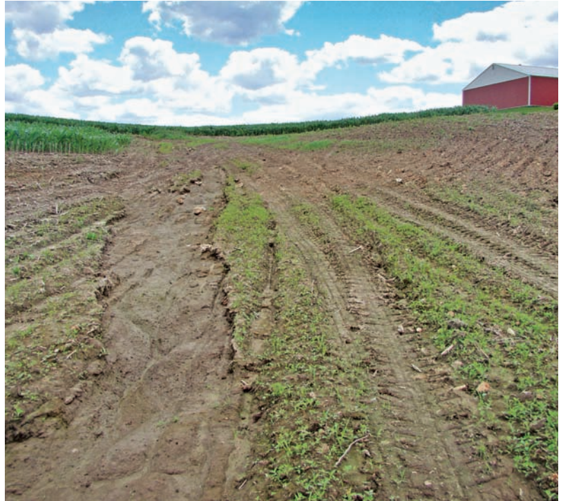
Erosion damage to a waterway caused by a June storm.

“There are situations where a detailed engineering plan is necessary, yet, there are many situations where simpler, non-engineered practices will do the job.”