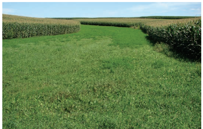
Waterway in good working condition.