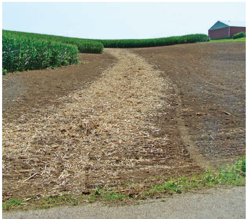
Damaged waterway from above, after reshaping and reseeding.