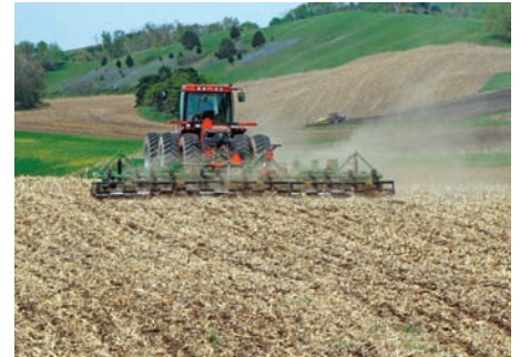
Minimum-till on erodible landscape.