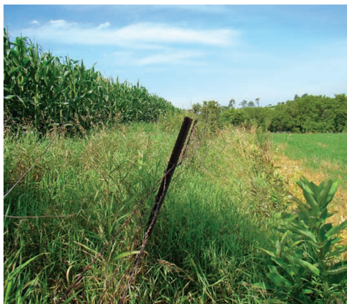
Elevation difference at property line.

The line where cropland and non-cropland meet is the last line of defense to protect against soil loss. These areas can contribute to soil loss, and may be in need of repair and management (a point that became clear during Discovery Farms walkovers). Areas commonly in need of a closer look are located where cropland meets boundaries like property lines or wooded ravines, or where waterways transition between landowners or land uses.