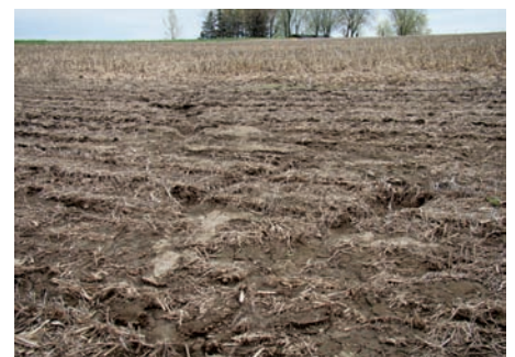
Concentrated rill erosion after soybeans.