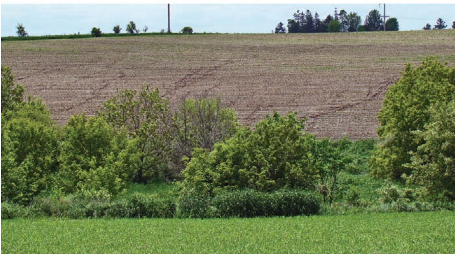
Widespread in-field erosion.