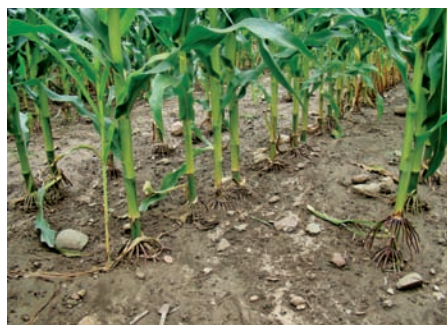
Sheet erosion during growing season exposes roots and rocks.